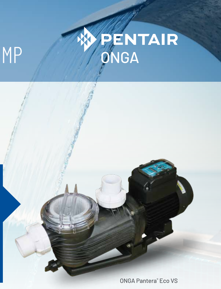
ONGA Pantera® Eco VS

Eco Select® products are designed to help you save energy, conserve water, eliminate or reduce noise, or otherwise contribute to a more environmentally responsible equipment system.