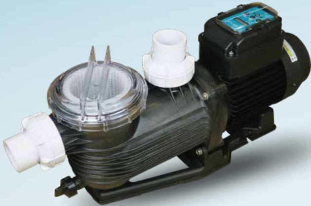
ONGA Pantera® Eco VS