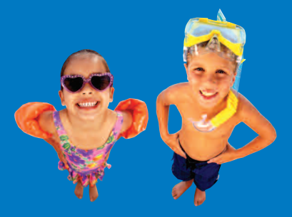
Reemay is resistant to chemicals, an important characteristic for the treated water in a pool or spa.