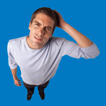
Reemay fabric is durable and strong enough to perform, cleaning after cleaning. That's why it's been the industry standard for 30 years.