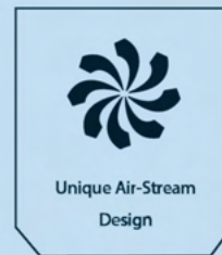
Unique Air-Stream Design