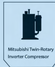
Mitsubishi Twin-Rotary Inverter Compressor