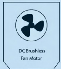
DC Brushless Fan Motor