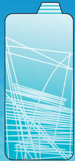
POOL COVERAGE COMPETITOR CLEANER 2hrs