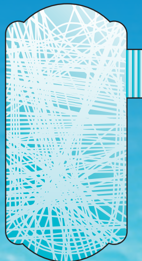
POOL COVERAGE POOLSWEPEA WALLCLIMA 2hrs

WALLCLIMA's advanced scanning programme maps the pool surface contours and obstacles, and efficiently cleans the floor, walls and water line over a series of passes. The competitor model at right has tracked less passes over the pool surface, which results in missed surface grime.